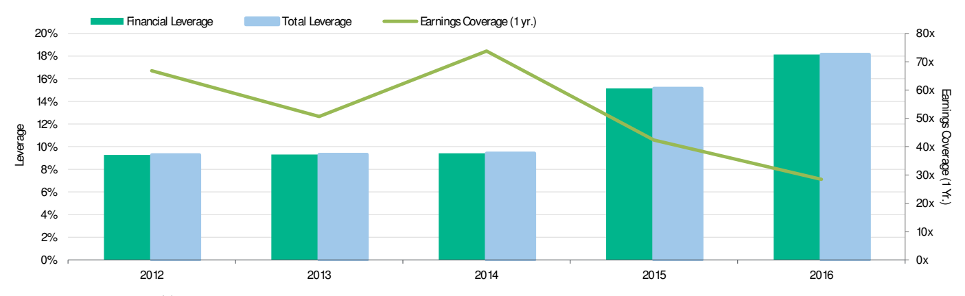
Exhibit 4 Financial leverage

Source: Company reports, Moody's Investors Service